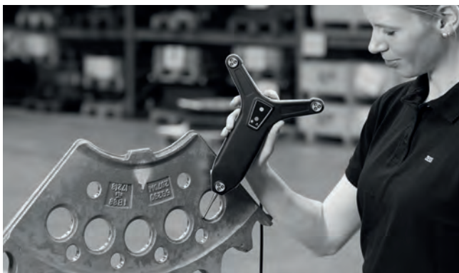
The hand-held ZEISS T-POINT touch probe – the ideal portable coordinate measuring machine for simple single-point measurements

Outstanding technical features, e.g. the high dynamic range for scanning on diverse object surfaces and a hitherto unmatched data rate, allow for an unparalleled scanning speed and precise measuring results.