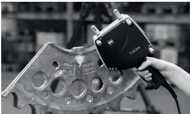
Quick and intuitive 3D data capture with the hand-held ZEISS T-SCAN laser scanner

The high-performance ZEISS colin3D software platform ensures a consistently efficient and project-oriented workflow during the entire measuring process.