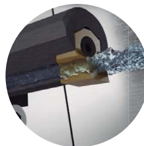
Internal Coolant through (optional)