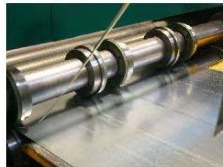
Slitting cut detail.

Fully automated and programmable, with some adjustments necessarily manuals have a total reliability.