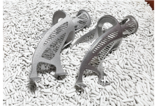
polishing of scalmalloy SLM satellite brackets