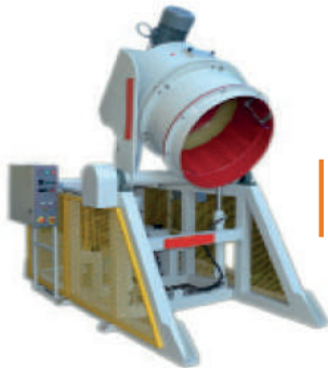
etSHAKE High speed turbo polishing