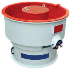
ecSHAKE From small to medium parts

Main benefits are: a controlled reduction of the surface roughness and improved feel and aesthetics .