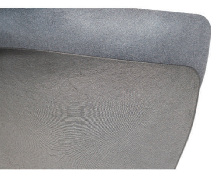
before and after Abrast Media